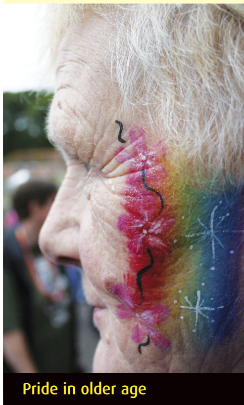
Pride in older age