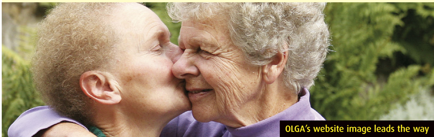
OLGA's website image leads the way

We also attended York 50+ Festival, with the OLGA stall and