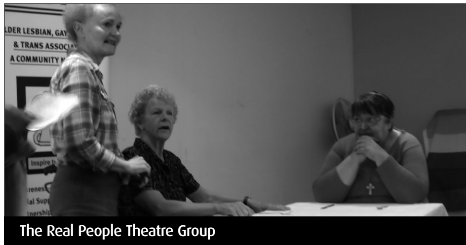
The Real People Theatre Group

Also, we were entertained by a most interactive and enjoyable Drama presentation, by The Real People Theatre Group from York. Audience input and participation was fabulous. OLGA can recommend this Drama