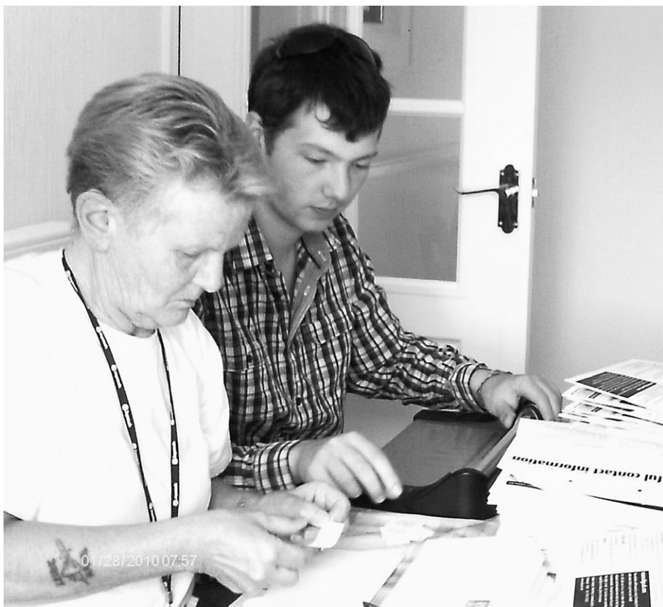
OLGA Newsletter, being distributed by our volunteers

We have members all over the Country, not just in the Scarborough Area. Members have a right to Vote at the AGM and can be befriended, either by phone or email.