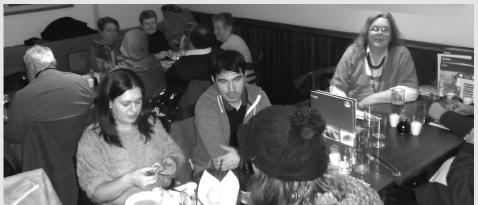
A Winter Social Meal Together

a restaurant. For many Gay & Trans people, especially older ones, this could be the only social eating they do.